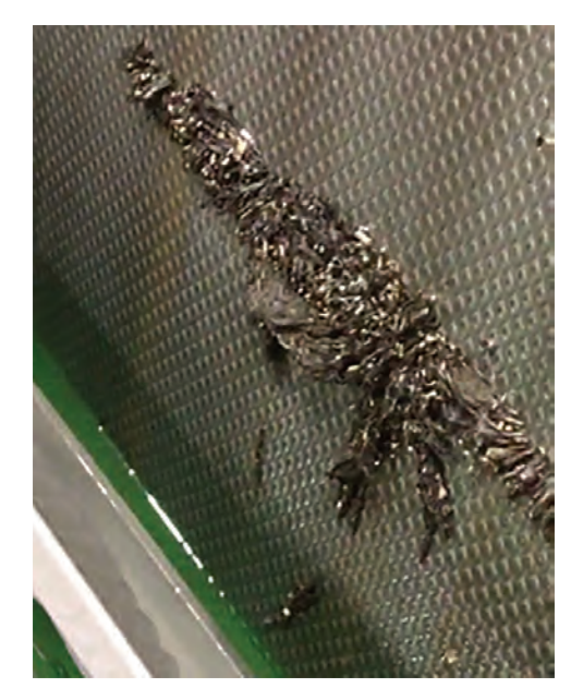
Ferrous chips being pulled up the incline section of the conveyor unit